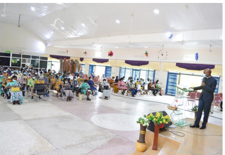
Section of Central Region staff at the service