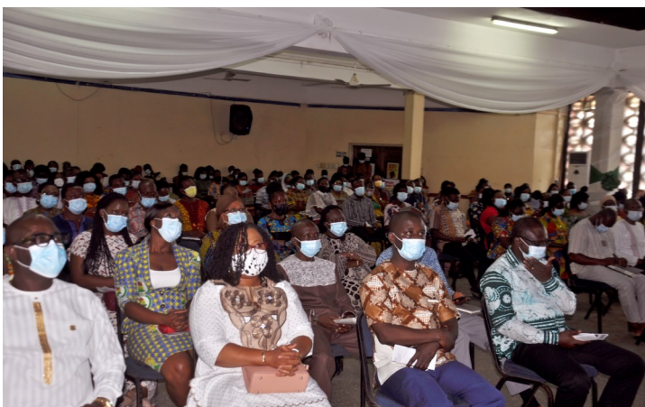
Section of Accra Staff at the service

The sermons preached in the regions bordered on giving thanks to God and the importance of thanksgiving, and being truthful and eschewing materialism as state auditors.