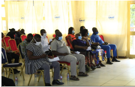
Section of Volta Region staff at the service