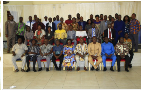
Volta Region group picture