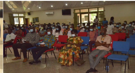
Section of Ashanti Region staff at the service