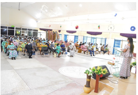
R.A Central Region delivering New Year message