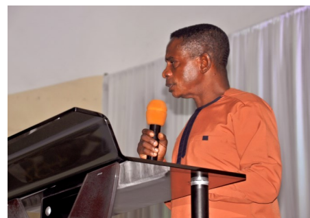
Acting Auditor-General delivering new year message