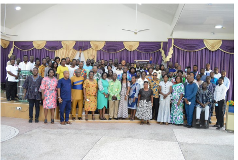
Central Region group picture