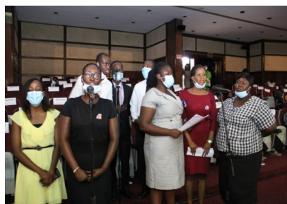
Audit Service choir in action