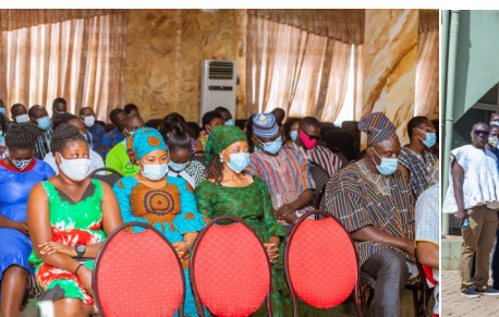
Section of Upper East Region staff at the service