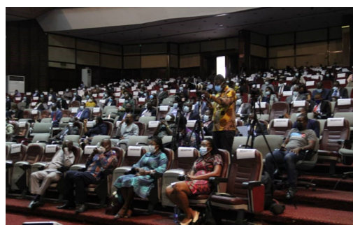
Section of audience in the auditorium