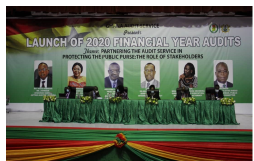
Speakers seated on the podium