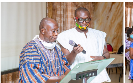
R. A Upper East Region delivering New Year message