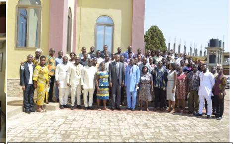
Bono, Bono East and Ahafo Regions group picture