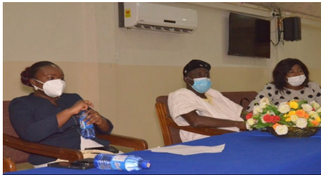
Ashanti Regional Auditor with invited guests