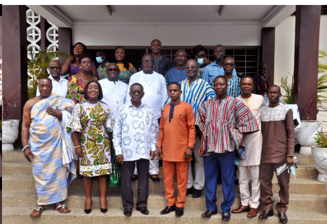
Board and Management members in group picture

Mission: We promote good governance, transparency, accountability and probity in Ghana's public financial management system by auditing to recognized international standards and reporting our audits results and recommendations to Parliament