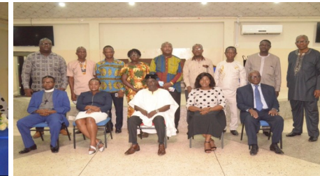
R.A Ashanti Region, District auditors with invited guests