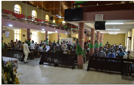
Section of Bono, Bono East and Ahafo Regions staff at the service