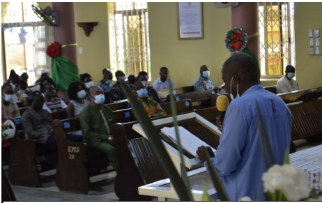
R. A Ahafo Region delivering New Year message