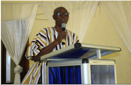
R. A. Volta Region delivering New Year message