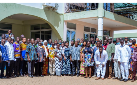
Upper East Region group picture