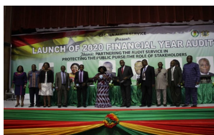
Board and Management Members and speakers