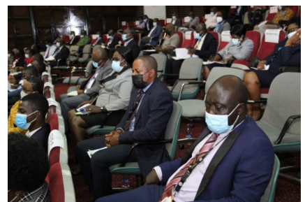
Section of audience in the auditorium